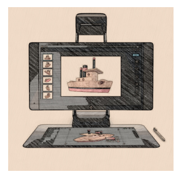
Figure 1: Sprout Sketch [9]

does bring an important aspect of what are the best use cases for the typical tabletop. Education and collaborative work, among others are possible fit for the tabletop. For example, education is a natural fit, since most K-12 (grade school) and higher-education remain using desks in their classrooms (for the most part). Collaborative work, as shown with Diamond Touch [4, 6, 6], have shown that multiple users may find useful performing certain tasks in a the same tabletop.