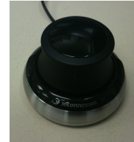
Figure 3: 3D Mouse

The first question asked in the introduction was: What is the most appropriate mapping between the 2D interface surface and the 3D world? We have proposed a simple solution to the problem, through the set of gestures described above. Defining and implementing the most natural mapping between this 2D multi-touch interface and the 3D world may still require additional work, but the concepts advanced in