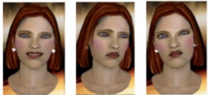
Fig. 3. Dynamic Facial Expression Animations

able to read text with a natural voice; set of different natural languages to enable the avatar to be multilingual (English first, and Spanish will follow); the possibility to manipulate vocal intonation in order to add to the agents believability.