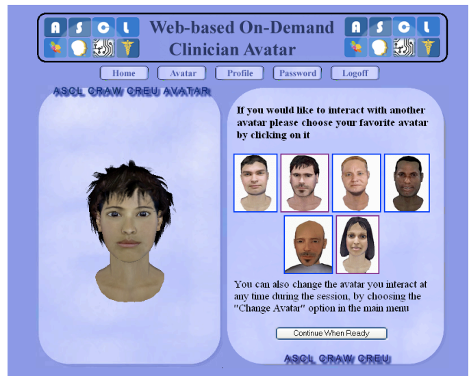
Fig. 2. Web Interface gives choice of avatars

We have already identified specific features of ECAs that are important - if not necessary - to include in the design of computer-based interventions for health promotion behavior [20]. We integrated these features in our current prototype: 3-dimensional (3D) graphical avatar (facial and/or half/body) [21]; a set of features to portray different ethnicity features on the 3D avatar (e.g. skin color, facial proportions); a set of custom-made facial expressions capable of animating the 3D avatar with dynamical believable facial expressions (e.g. pleased, sad, annoyed); text-to-speech (TTS) engine to be